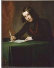
Charles Dickens (1842) Details of Term Paper