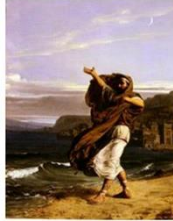
Demosthenes Practising Oratory (1870) Details of Presentation